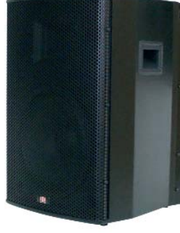
Passive annex cabinet SP12